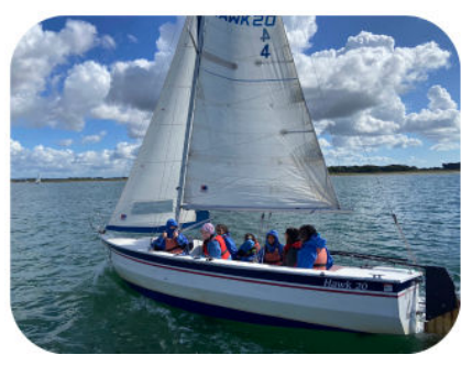
Rowing and sailing at Cobnor