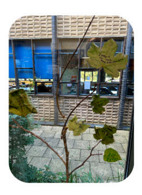
Pupils wearing green and some of our green pledges to commemorate Green Day